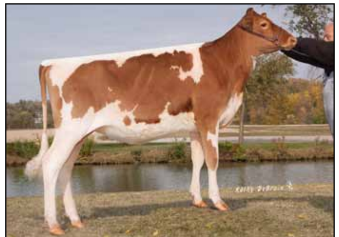
Coulee Crest HP Crown J Jazzy-ET VG-86

All-American & Jr. All-American Spring Calf 2014 Full Sister to Dam of Lot 6