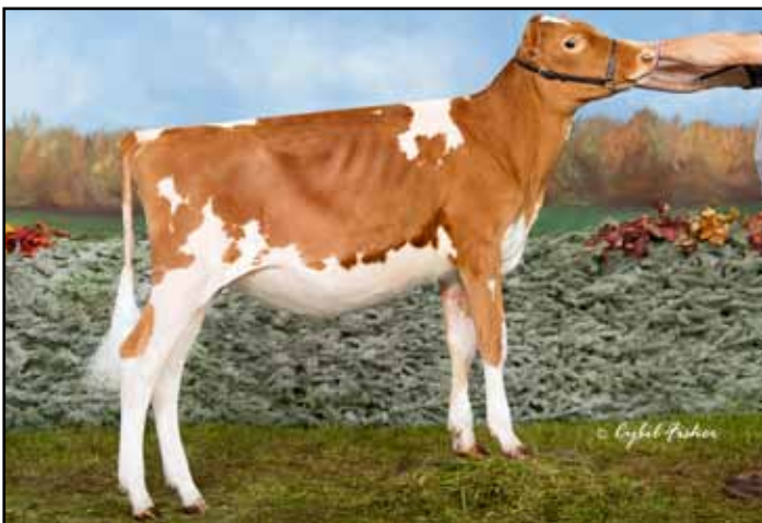
Coulee Crest AP Jinx-ET

Nominated All-American Fall Calf 2013 Maternal Sister to Dam of Lot 6