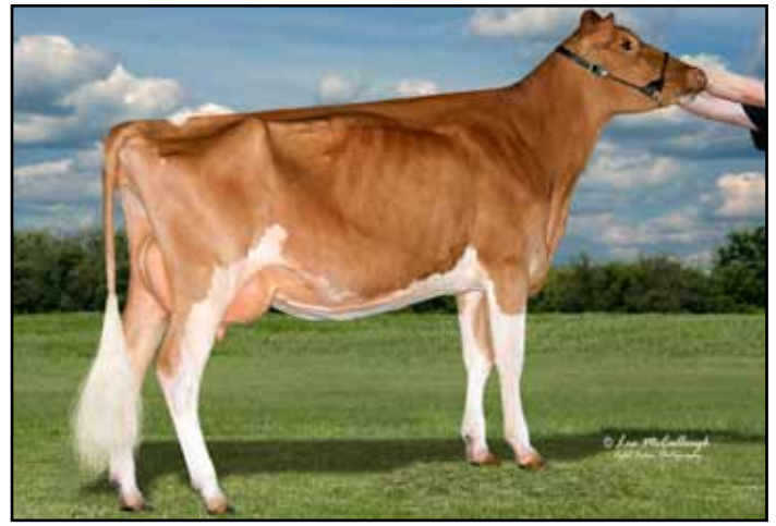
Jastes Vinny Persimmon Nominated All-American Milking Yearling 2014 Paternal Sister of Lot 33