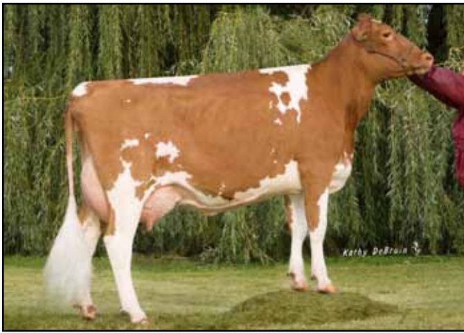
Coulee Crest Chall Jade-ET VG-84

4-03 365D 3X 31,230M 4.6% 1,431F 3.4% 1,067P Maternal Sister to Dam of Lot 6