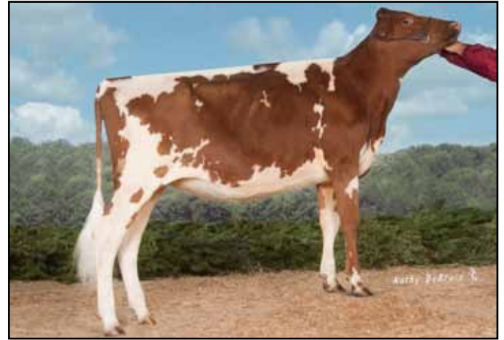
Coulee Crest Fame Joanna-ET

2X Jr Champion World Dairy Expo Maternal Sister to Dam of Lot 6