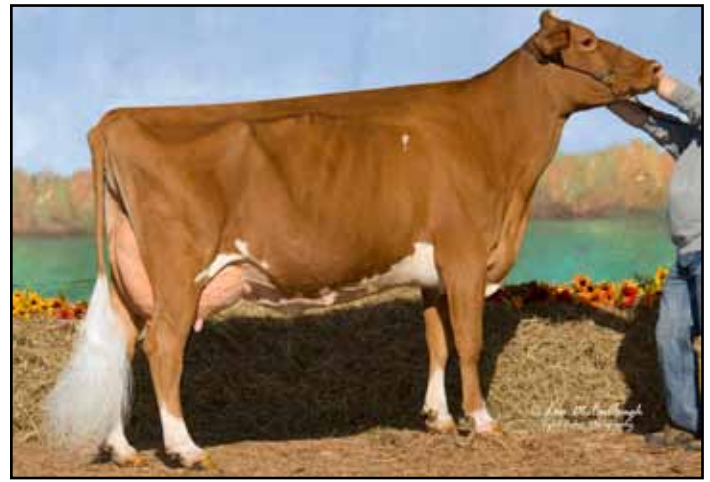
Rae Mar Regis Lindy-ET EX-90 4-09 365D 20,910M 3.0% 619F 2.9% 612P Maternal Sister to Dam of Lot 10