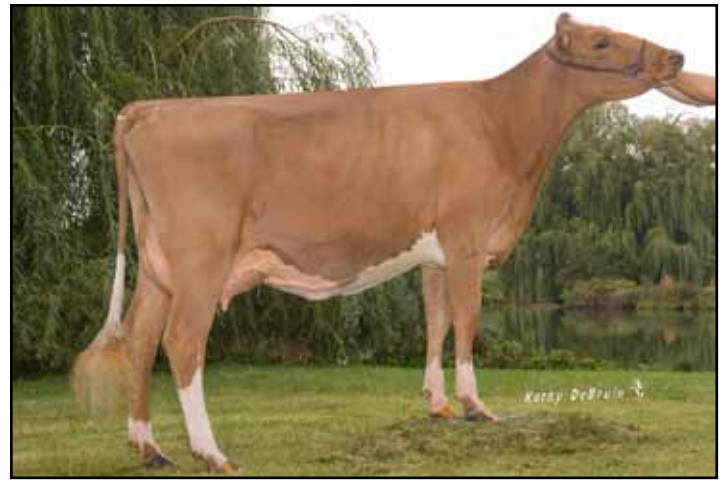
Coulee Crest Kringle Jackie VG-87

4-03 365D 3X 31,230M 4.6% 1,431F 3.4% 1,067P Maternal Sister to Dam of Lot 6