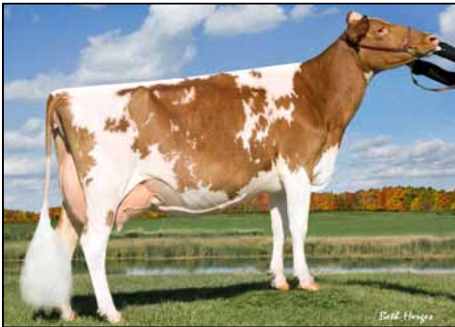
Coulee Crest Chall Jeanie VG-87

HM Jr. All-American Sr. 2-year-old 2013 Maternal Family Member of Lot 6