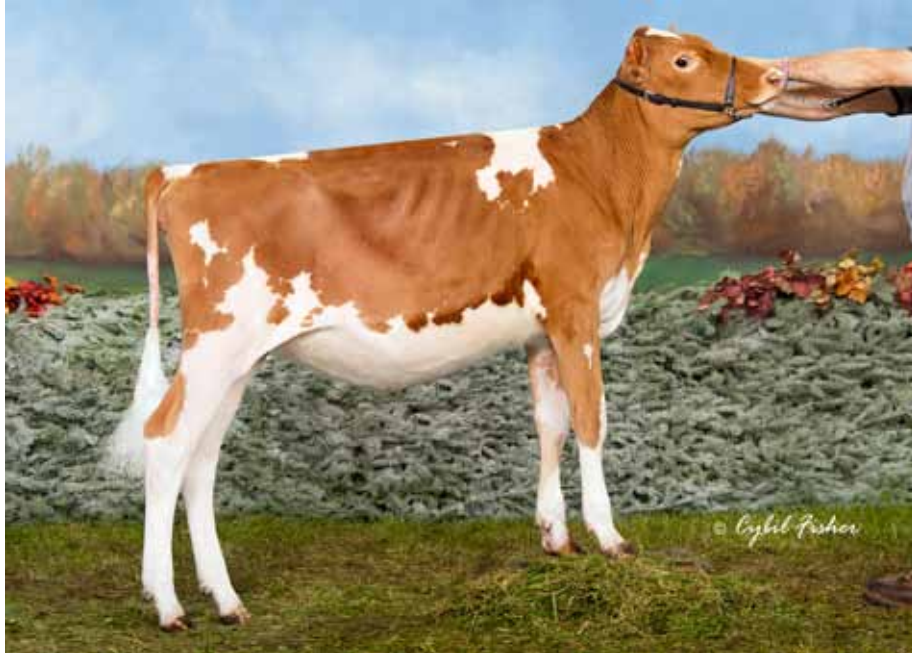
Coulee Crest AP Jinx-ET - All-American Spring Calf 2014 A maternal family member sells!