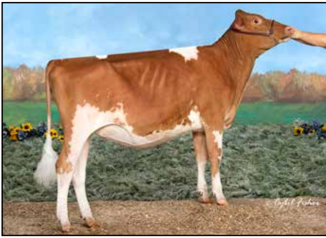
Warwick Manor B Cadence

1st Fall Calf & Res. Jr. Champion MD State Fair 2015 Dam of Lot 61