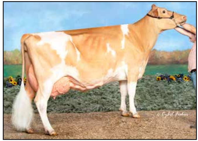
Warwick Manor Kojack Cutie EX-91

1st Fall Calf & Res. Jr. Champion MD State Fair 2015 Dam of Lot 61