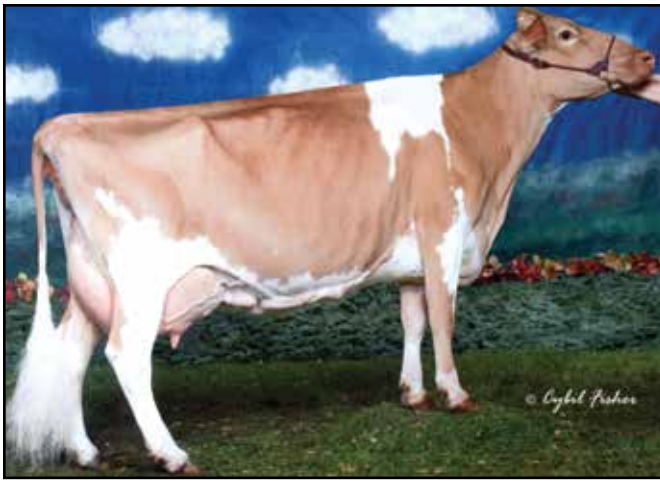
Chupps Farm Goldstar Dazzle EX-94 Six-Time All-American Honoree 2nd Dam of Lot 59