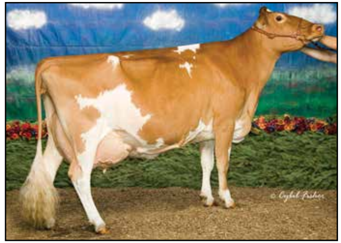
Chupps Farm Warden Dulcy EX-93 Junior All-American Sr. 2-Year-Old 2005 Maternal Sister to 2nd Dam of Lot 59